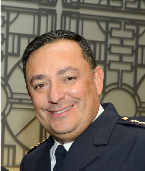
Figure 4. ART ACEVEDO, Police Chief