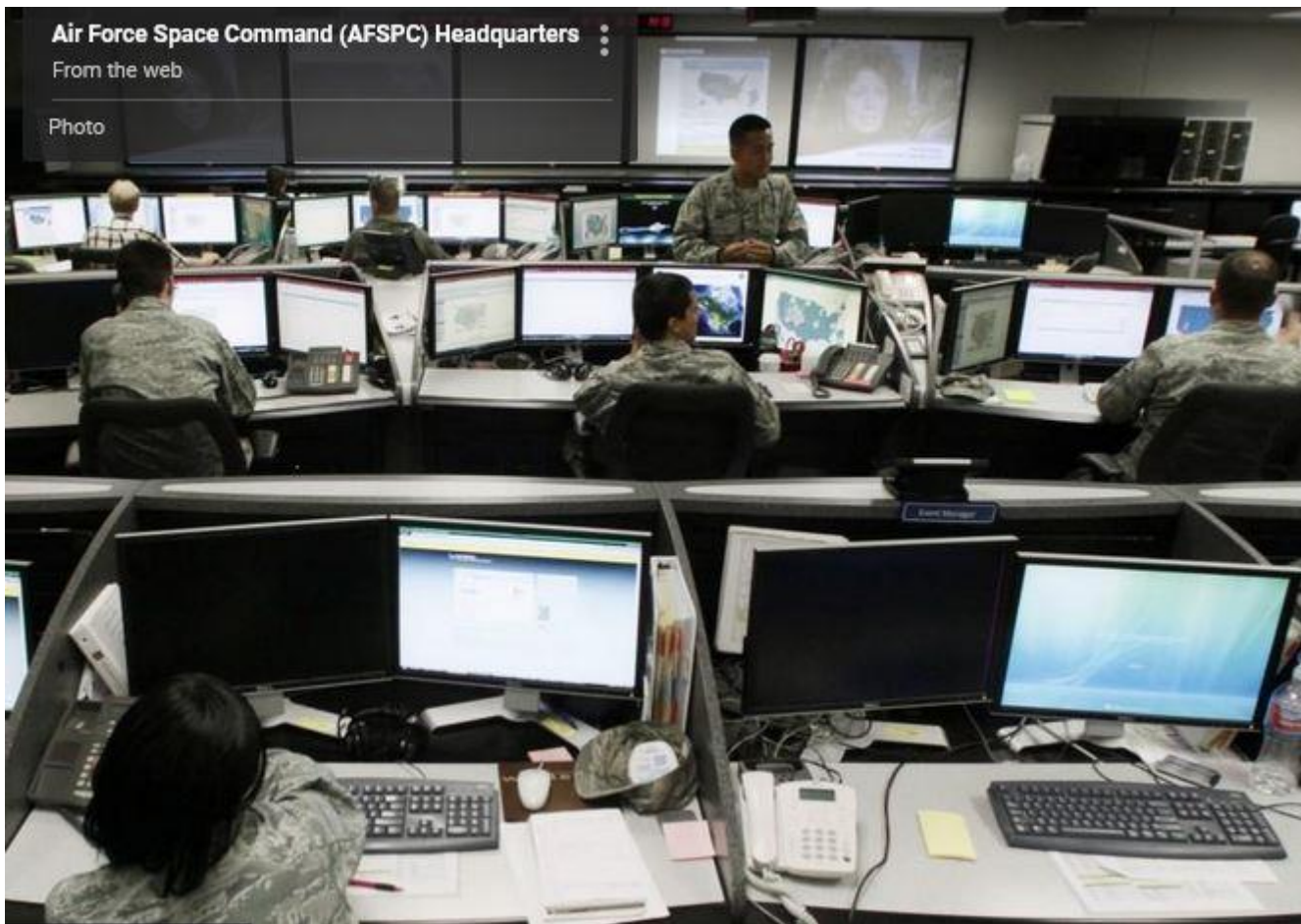
Figure 3. One of the Satellite Control Rooms (possibly a training center) at Air Force Space Command, Peterson Air Force Base.

So, this is how it works: There are hundreds of microwave weapons installed on satellites as “payloads”. The Space Duty Orders come from the 50 th Operational Support Squadron (OSS). This Squadron determines which satellites are available for duty assignments for each day. Some of the satellites will have problems each day, such as malfunctioning software, solar panel problems, software upgrades, etc. This Squadron informs the other units which satellites & weapons are available that day.