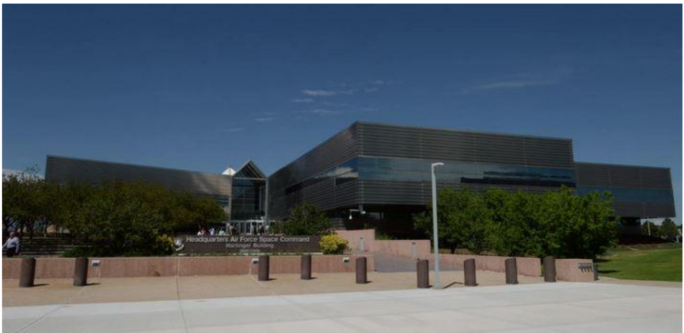
Figure 2. Headquarters - Air Force Space Command, Peterson Air Force Base.

The Air Force Space Command has about 38,000 employees, based at many locations, and has its headquarters in Colorado Springs at Peterson Air Force Base. As previously noted in my ebooks, the satellite tracking frequencies have been scientifically measured at 3600 MHz - 3750 MHz, and the attack frequencies for the Vircators are 3920 MHz – 3935 MHz. These frequencies are confirmed by the FCC frequency allocation table. See my ebook “Targeted Individuals: Technical Information”